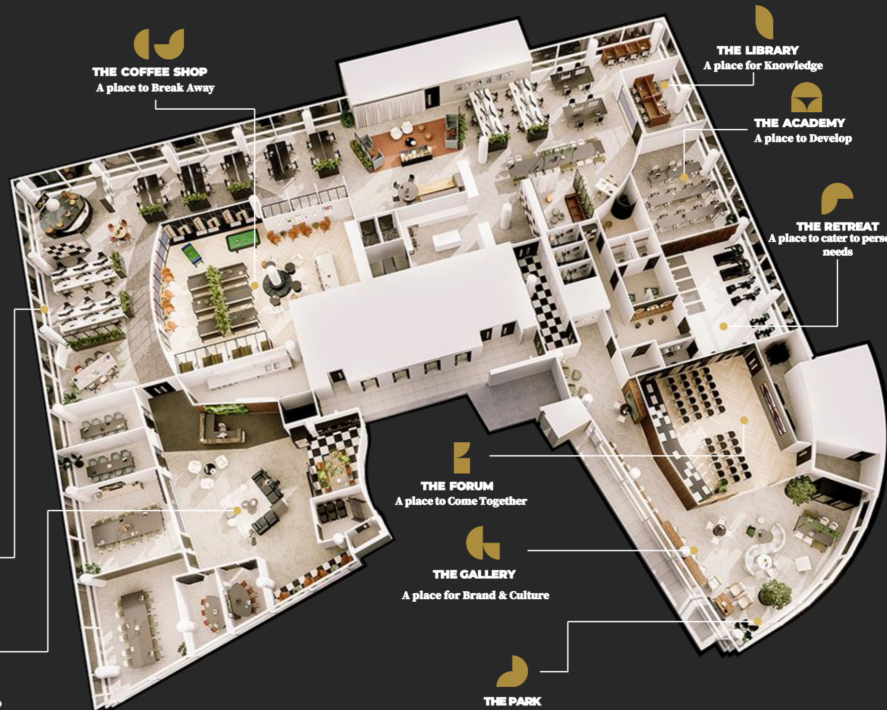
THE COFFEE SHOP A place to Break Away