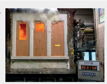
FIRE TESTING & CERTIFICATION