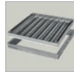
FLOOR ACCESS COVERS