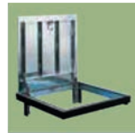
FLOOR ACCESS DOORS