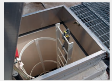
ROOF ACCESS HATCHES