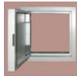
WALL AND CEILING ACCESS