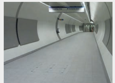
FLOOR ACCESS COVERS

To arrange a CPD Seminar at your premises or online: